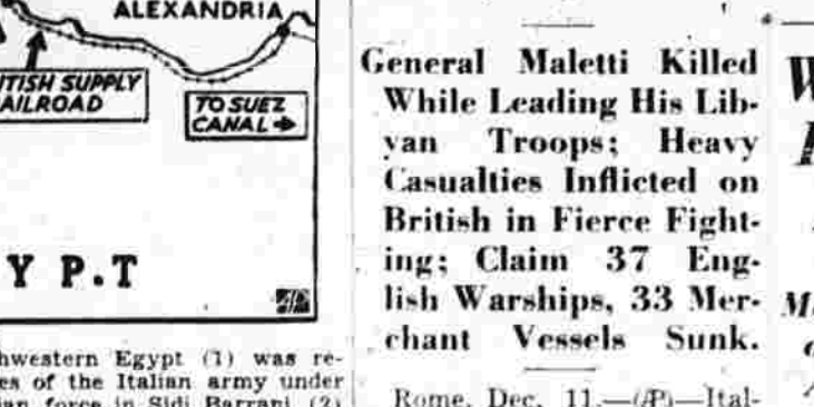
British Trap Italians in Egypt

General Maletti Killed While Leading His Libyan Troops; Heavy Casualties Inflicted on British in Fierce Fighting; Claim 37 English Warships, 33 Merchant Vessels Sunk.